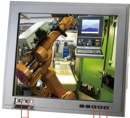
USB x 2 LCD On/Off Brightness + Brightness -

17" Rugged Fanless Touch Panel PC with Intel® Celeron® 827E/ Core™ i7-2610UE Processor, 2 GB RAM